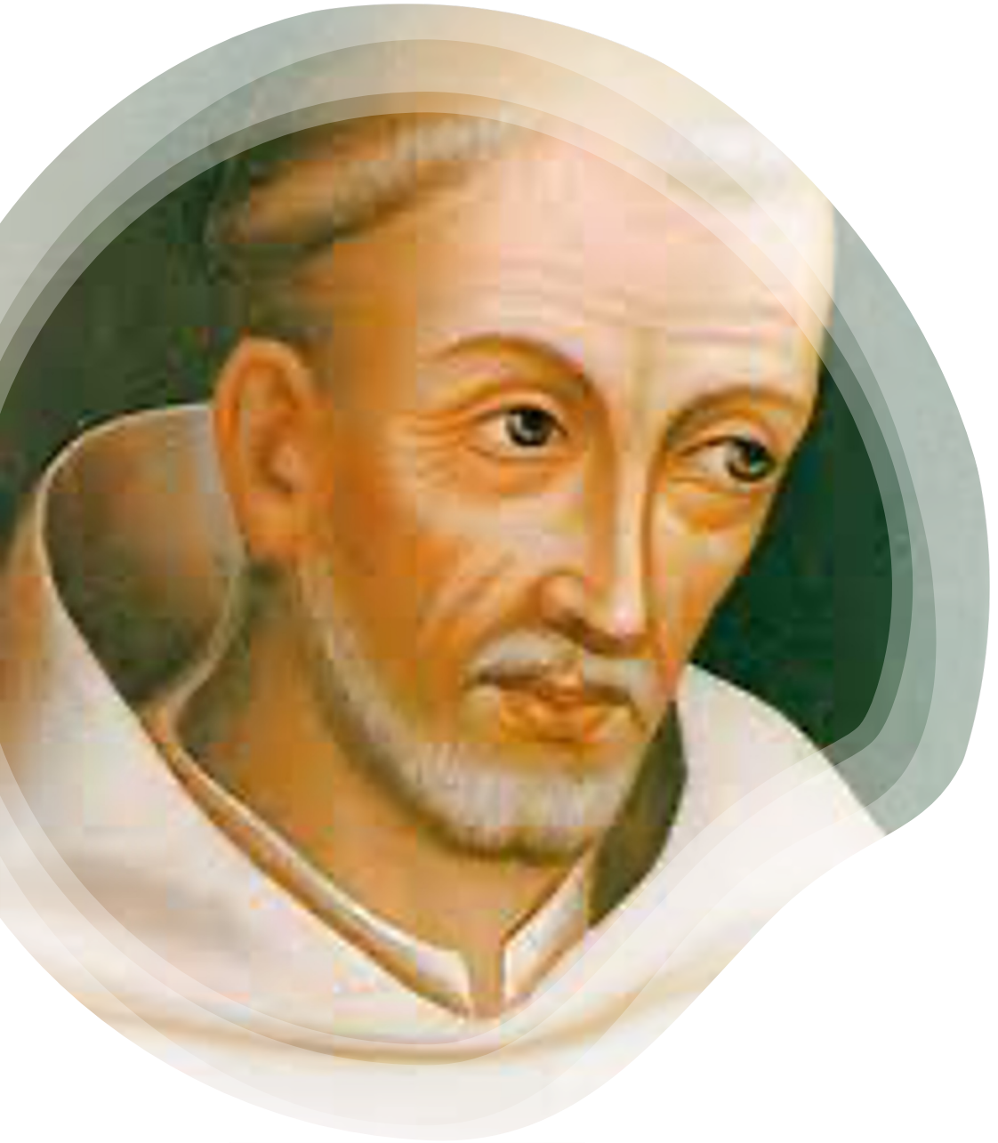
Bernard of Clairvaux (1090-1153)