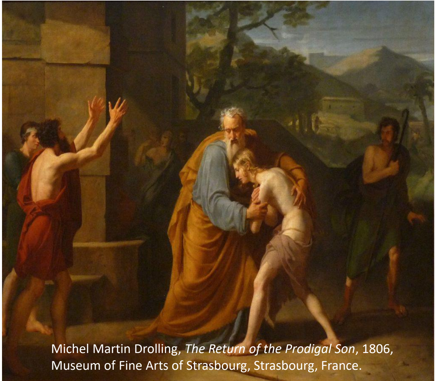
Michel Martin Drolling, The Return of the Prodigal Son , 1806, Museum of Fine Arts of Strasbourg, Strasbourg, France.

— Henri Nouwen, Return of the Prodigal Son