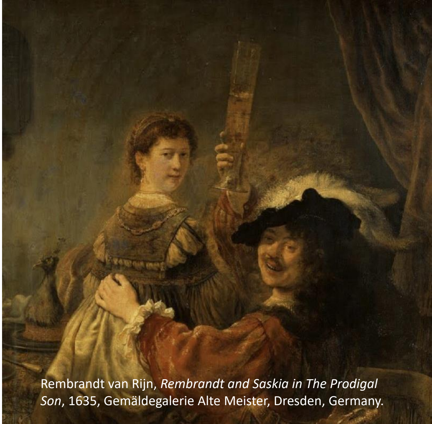
Rembrandt van Rijn, Rembrandt and Saskia in The Prodigal Son , 1635, Gemäldegalerie Alte Meister, Dresden, Germany.

Prodigal: Spending resources freely and recklessly; being wastefully extravagant.