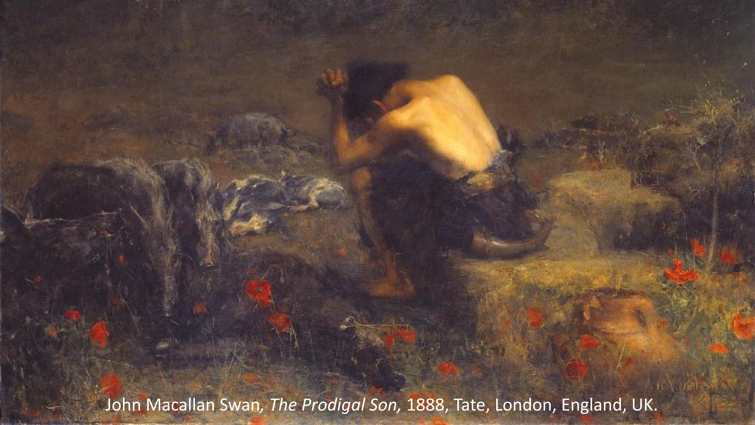
John Macallan Swan, The Prodigal Son , 1888, Tate, London, England, UK.