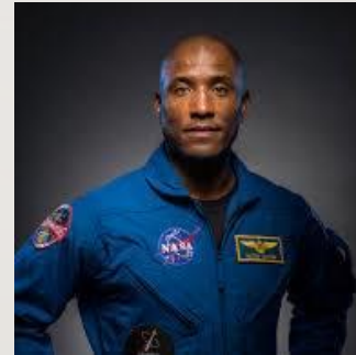
Victor Glover (NASA)