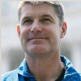
Jeremy Hansen