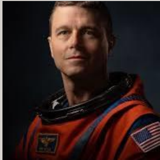
Reid Wiseman (NASA)